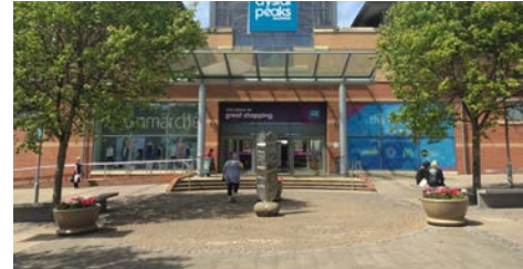
CRYSTAL PEAKS SHEFFIELD