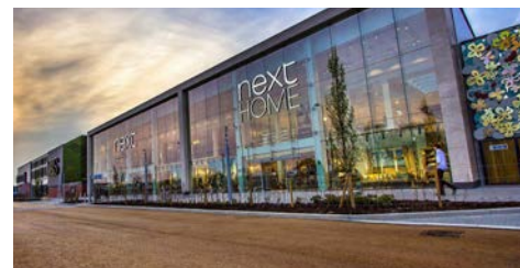
VANGARDE SHOPPING PARK YORK