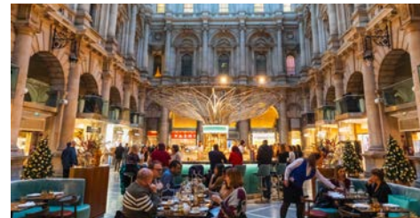
THE ROYAL EXCHANGE LONDON