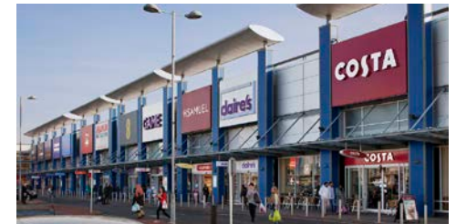
MANCHESTER FORT MANCHESTER