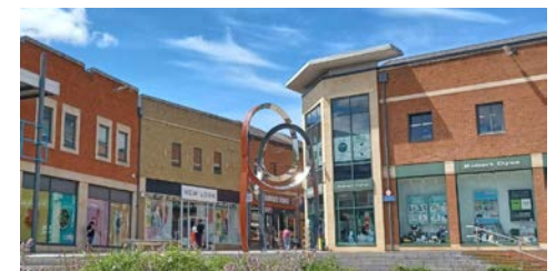
ORCHARD CENTRE DIDCOT