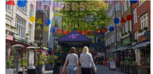
ST CHRISTOPHER'S PLACE LONDON